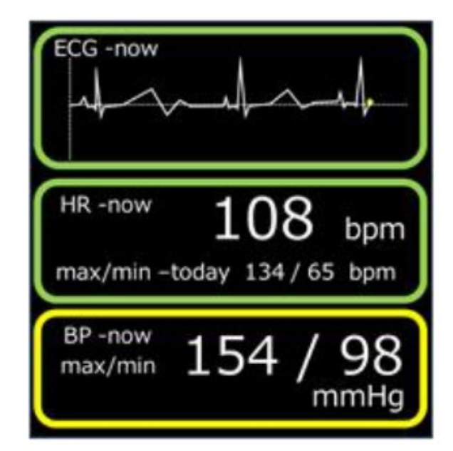
Figure 3. Graphic image for displaying a medical measurement result